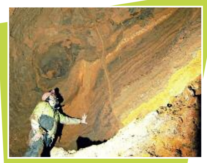
Sediment sequence: Masson Cavern.

Natural England ... supports the scientific exploration of caves and work to discover new caves. Without this work we would have no information on the extent of caves nor understand as much as we do about how cave systems have developed. Knowledge from cavers undertaking trips down known cave systems is also invaluable in keeping us informed of the condition of cave systems and alerting us to problems. (See useful contacts and links)