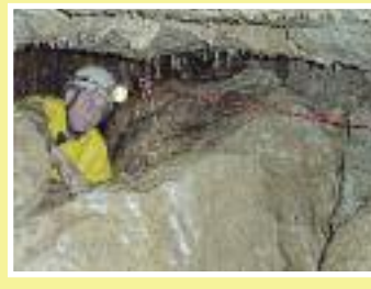
Taped pathway in Dreamtime.

CAVES...form a unique and vulnerable part of our natural and archaeological heritage as well as being a valuable scientific and recreational resource. There are, therefore, many reasons why they are protected and it is important that they are conserved for the benefit of future generations.